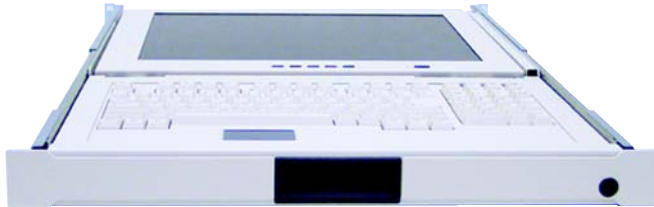
Unit in closed position